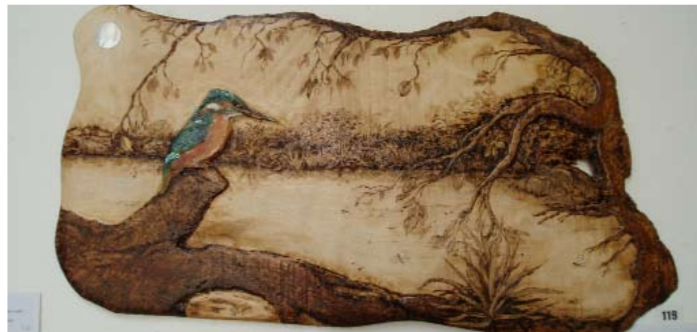
An example of wooden pyrography - by Victoria George.